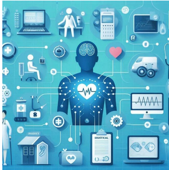
Fig. 1 Use of AI in healthcare management in hospitals.