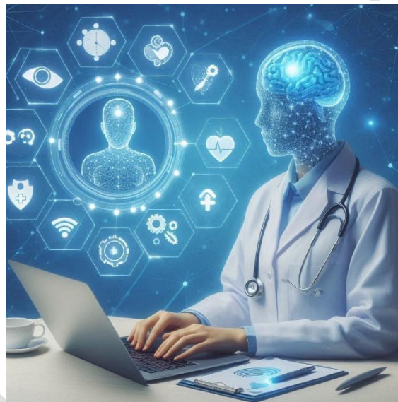
Fig. 2 Use of AI in patient health management.

This article seeks to explore how AI has been used to improve the quality of healthcare management, its benefits, and also the main fears that patients and institutions face in this regard. The above demonstrates the fundamental importance of developing robust legal frameworks that ensure AI is used responsibly for healthcare purposes, adhering to ethical criteria. The aim is to broaden the discussion to promote the application of AI for health and identify opportunities for improvement.