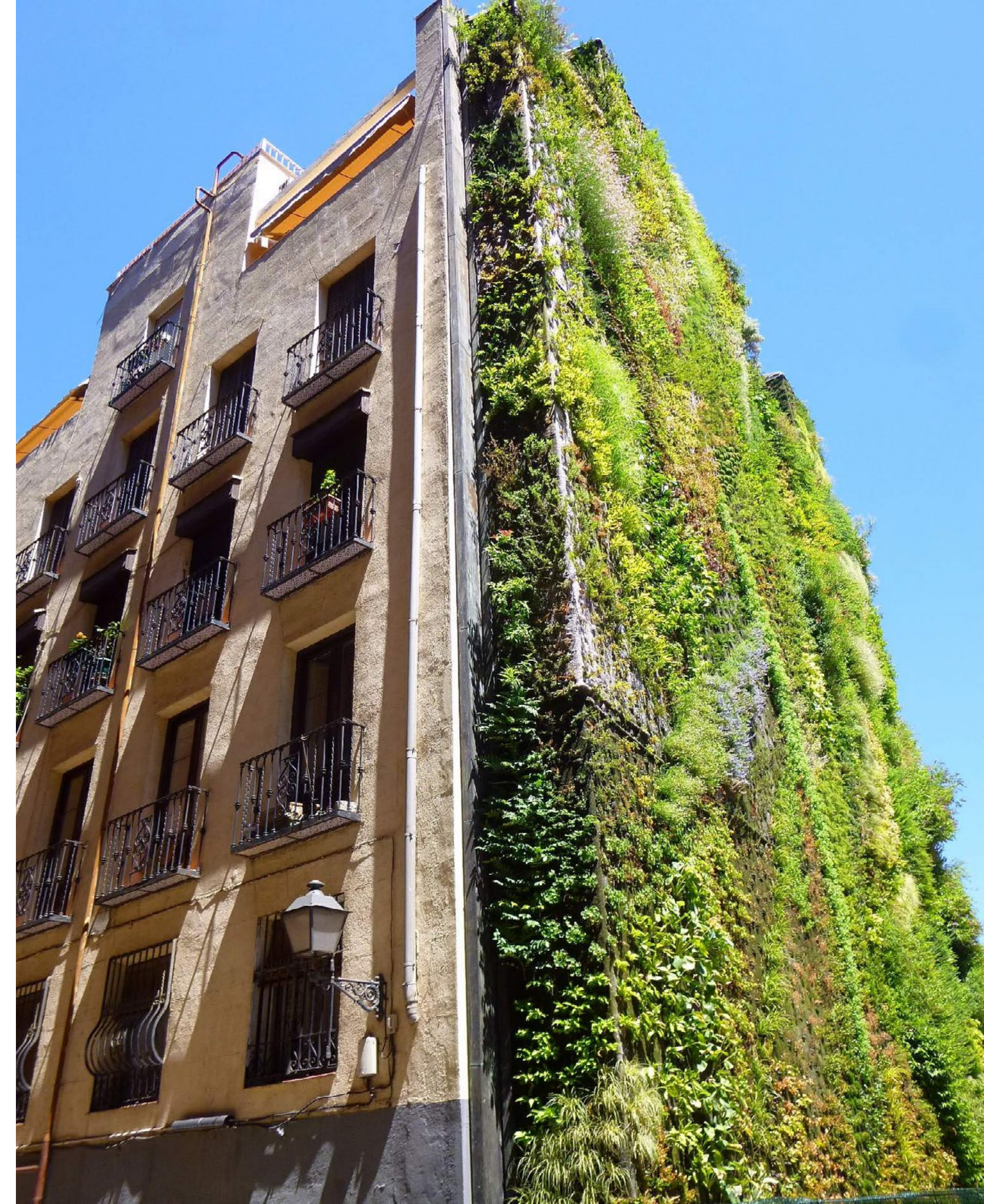
Figure 3. Vertical garden (living wall) in Madrid. Living walls have become popular over the last ten years; however, some have problems with irrigation or selection of plant species and have become a maintenance burden.