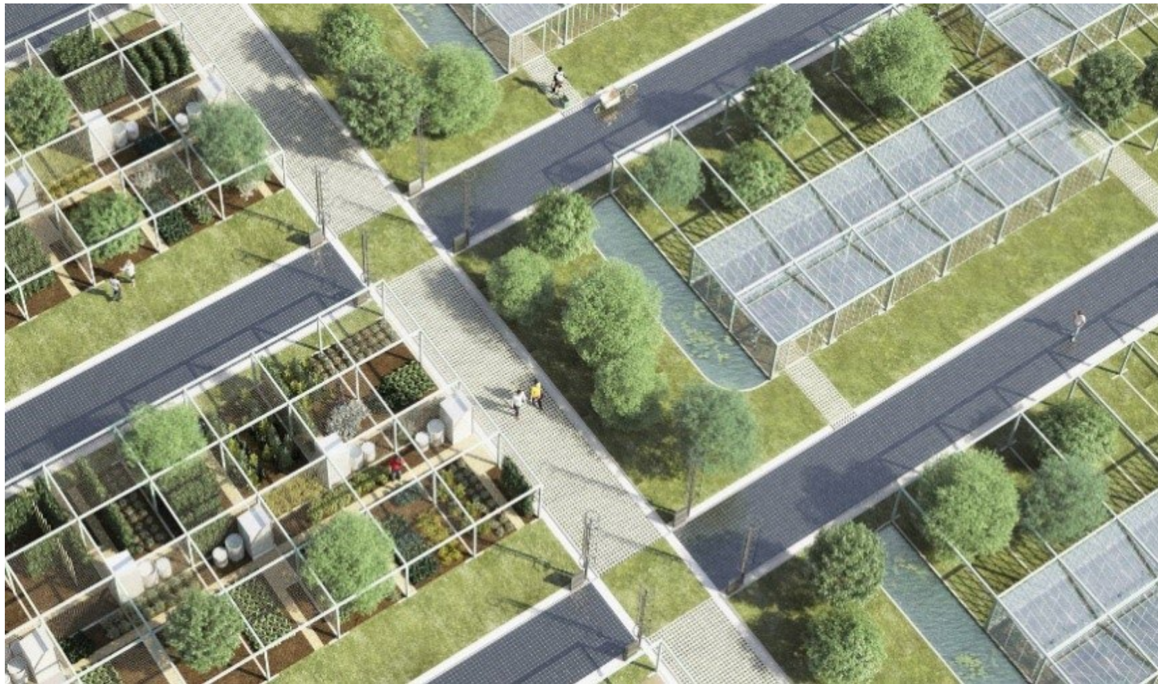
Figure 7. The conceptual proposal Car Parks 2.0 transforms large carpark lots into a productive field for urban farming; by French design firm Studio NAB, 2019.

space for charging electric cars from onsite solar panels (Figure 7). Greenhouses and fruit trees grow produce that can be supplied directly to the neighbouring store —similar to the model used by the urban farming company Gotham Greens, which grows produce in a greenhouse on top of a