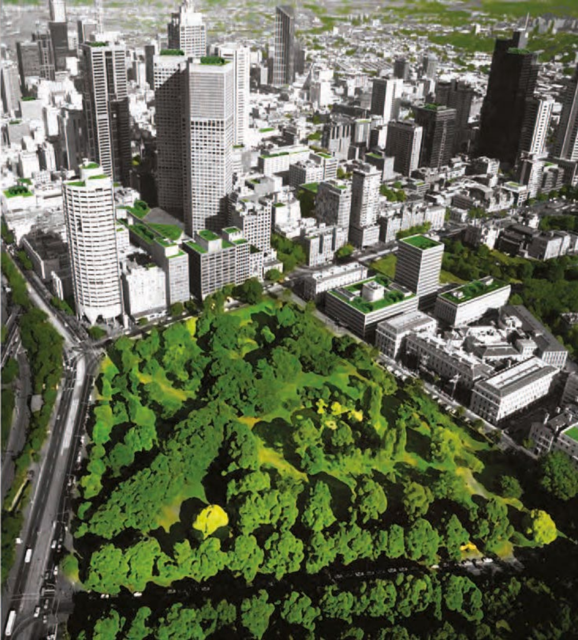
Figure 2. An urban forest in Melbourne, Australia, helps to keep the city cooler during heatwaves and binds dust from traffic. The City of Melbourne has formally embraced an Urban Forest Strategy with the aim to increase tree canopy cover from 22 percent to 40 percent by 2040 (the Strategy 2012-2032 is available online: https://www.melbourne.vic.gov.au/community/greening-the-city/urban-forest/Pages/urban-forest-strategy.aspx )